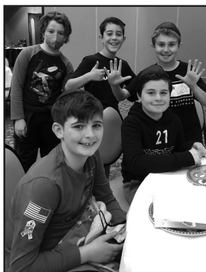
JFGRS Passover Seder on Sunday, April 3.

As we wind down our school year in May, we have many special activities planned. On Sunday, May 1 our Hay class and