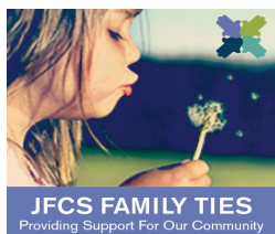
JFCS FAMILY TIES Providing Support For Our Community

Funding for the Lasko College Prep Program generously provided by the Lasko Family Foundation