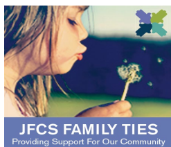
JFCS FAMILY TIES Providing Support For Our Community

Funding for the Lasko College Prep Program generously provided by the Lasko Family Foundation