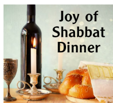
Joy of Shabbat Dinner

For tickets, go to https://theatreariel.thundertix.com/events/131033/performances