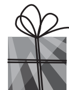
HAR ZION GIFT BOX

Sunday – 9:30 AM-12:30 PM (when school is in session)