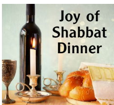
Joy of Shabbat Dinner

Celebrate Shabbat as a Whole Family! Sing! Dance! Play! We will have our own Kiddush before joining the rest of the congregation for refreshments and socializing!