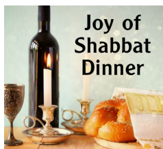
Joy of Shabbat Dinner

Joy of Shabbat Dinner – Friday, November 9 following 6 PM Services BYOB (Kosher unopened) RSVP REQUIRED