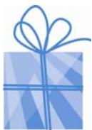
HAR ZION GIFT BOX