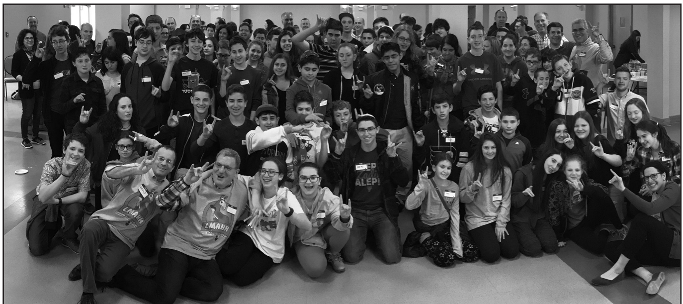
LMAHH (Lower Merion Area Hebrew High) – Successful kick-off event on Sunday, April 2 at Beth Am Israel. Students, Staff and Clergy from Har Zion, Beth Am Israel, Beth Hillel-Beth El, and Adath Israel joined together for a wonderful event.