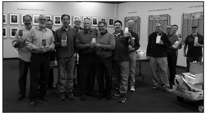
Men's Club members got together to assemble boxes for the Yom Hashoah Yellow Candle program.